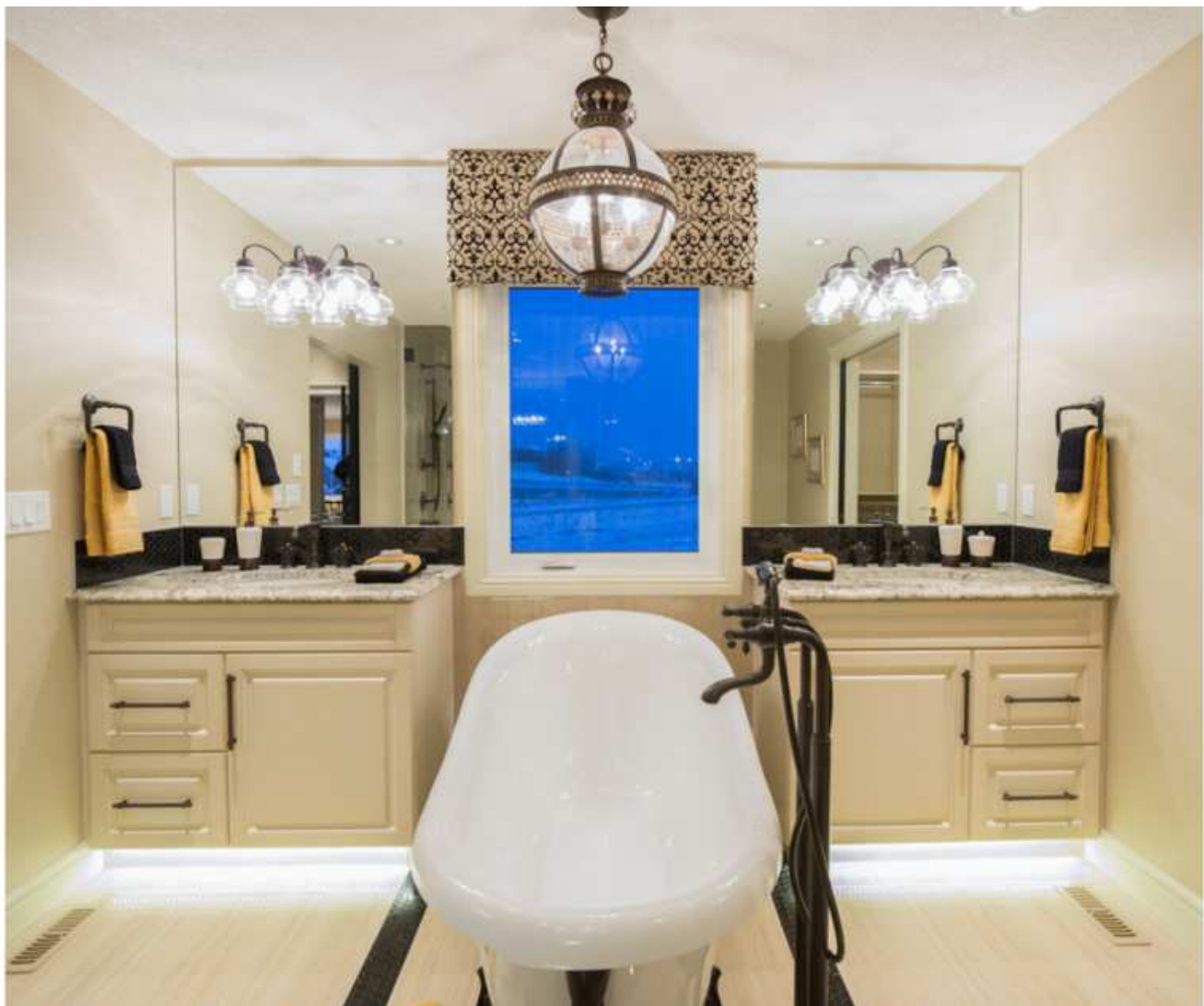
The ensuite off the master bedroom the Cypress 4A in Five Lakes at Rock Lake Estates.

Published on: April 29, 2016 | Last Updated: April 29, 2016 3:40 PM MDT