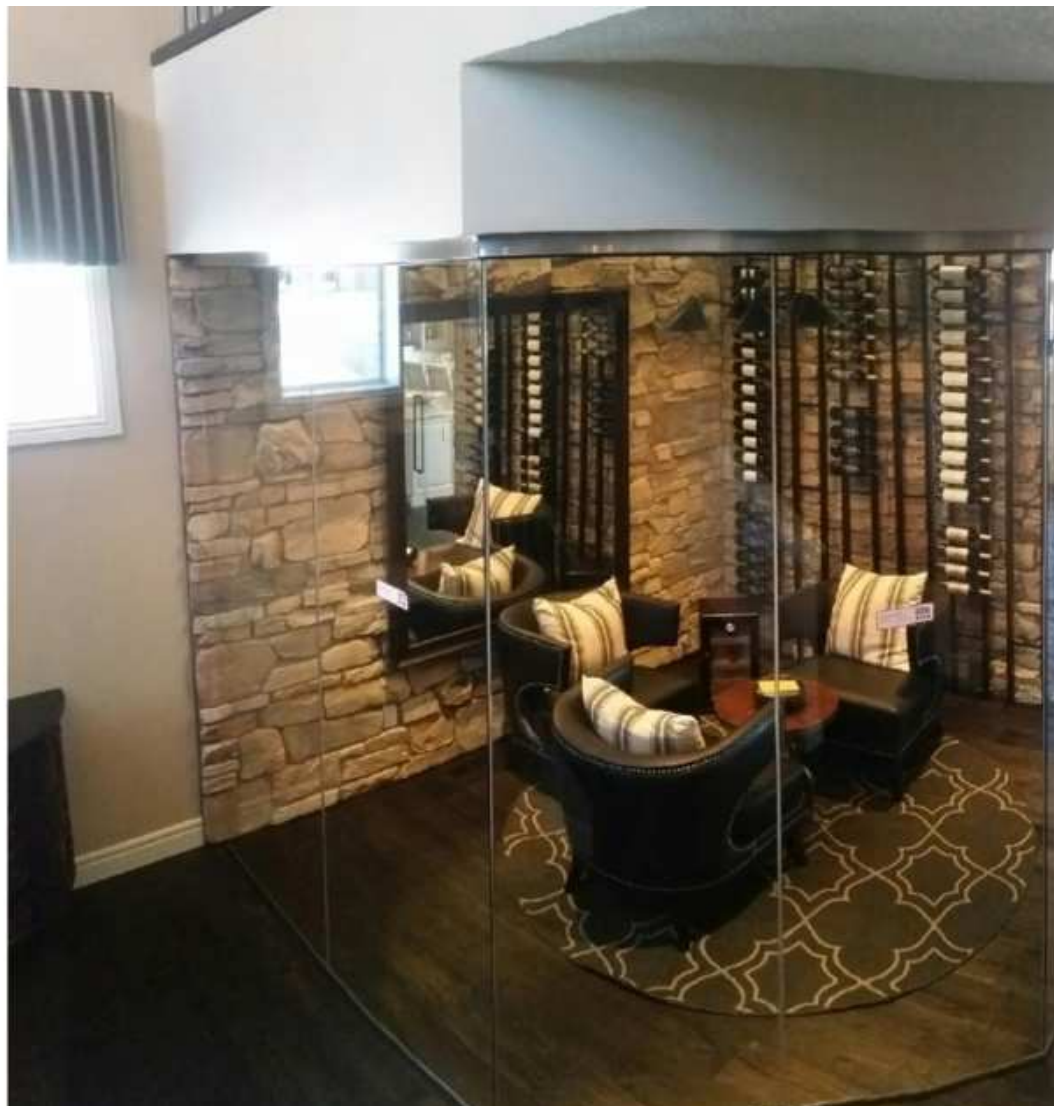
The wine tasting room in the Cypress 4A by Jager Homes.

The Cypress 4A is 2,662 square feet with three bedrooms and 2.5 bathrooms, across the top two levels, and now on display at Rock Lake Heights N.W. The home also has a double bay and single bay garage.